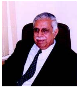
Justice M N Venkatachaliah