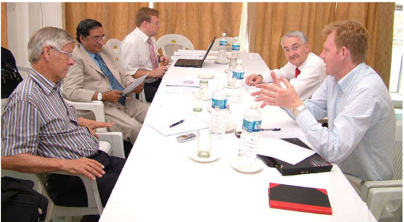
Golden Peacock Awards final grand jury meeting in progress under the Chairmanship of Dr Ola Ullsten, former Prime Minister of Sweden to select the Winners of Golden Peacock Environment Management Award 2007

Today there are three most eminent chief justices of India involved in the Golden Peacock Awards evaluation process. The Golden Peacock Awards committee is chaired by one of India's most eminent Chief Justice Justice P N Bhagwati. Not many people would be aware that this eminent judge courted arrest in 1942 in the Quit India movement. It is the deep commitment and burning patriotism that has characterised Justice Bhagwati's achievements. He has been the longest serving member of Human Rights Committee of the UN. Justice Bhagwati has been responsible for making a large number of innovations on advancing human rights in India through creative interpretation of the law. He expanded the reach and contacts of human rights embodied in the constitution and was the pioneer of the public interest litigation