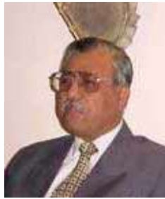
Justice A M Ahmadi