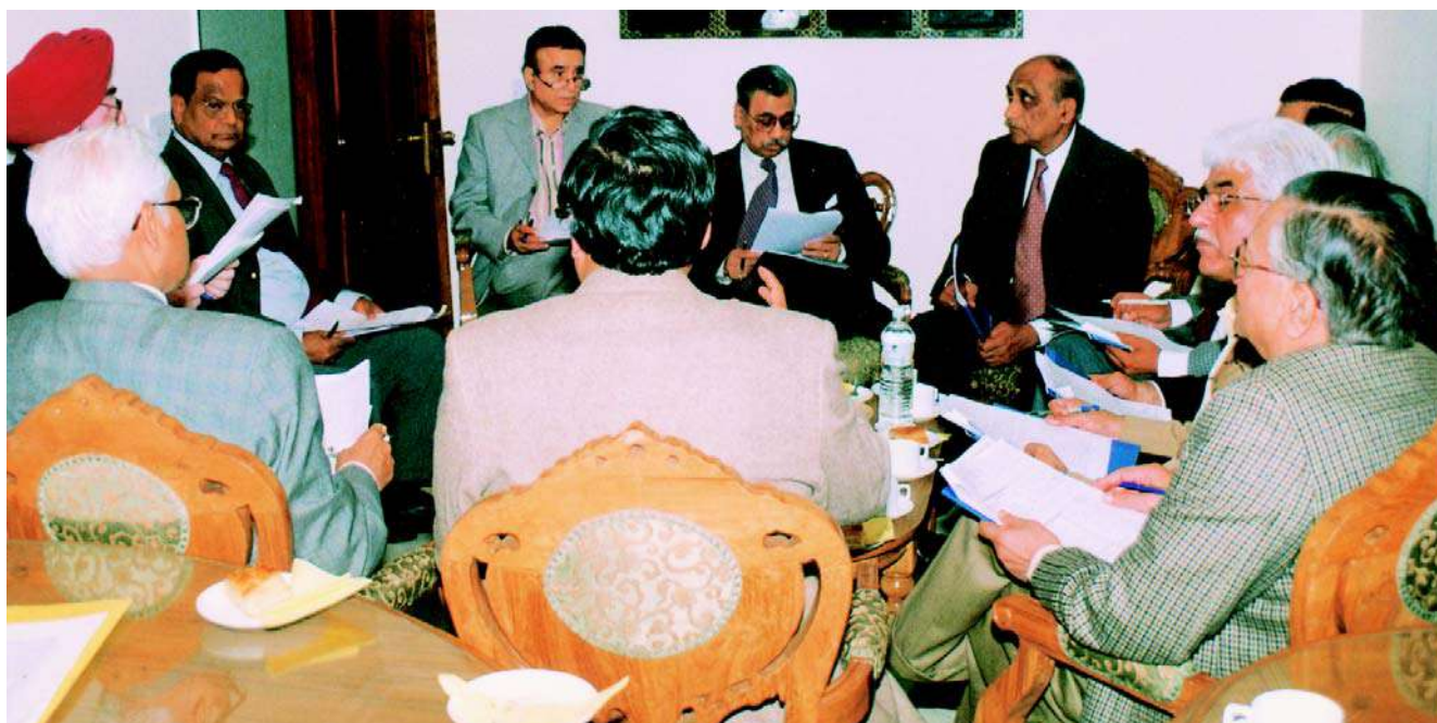
Golden Peacock Awards Grand Jury Meeting in progress under the chairmanship of Justice A M Ahmadi, former Chief Justice of India